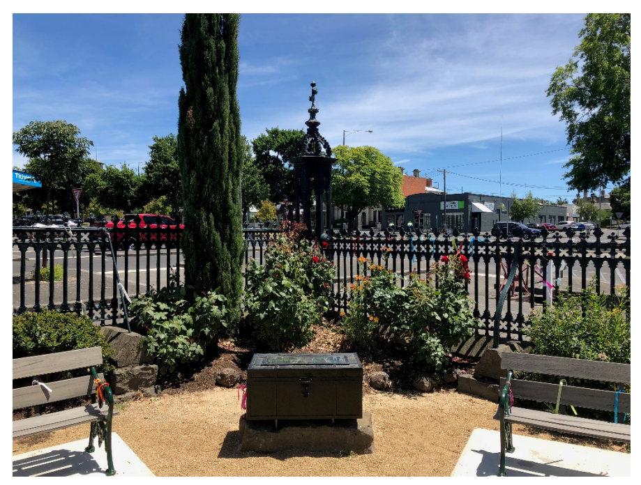
Figure 2.10 St Patrick's Cathedral memorial garden, Ballarat