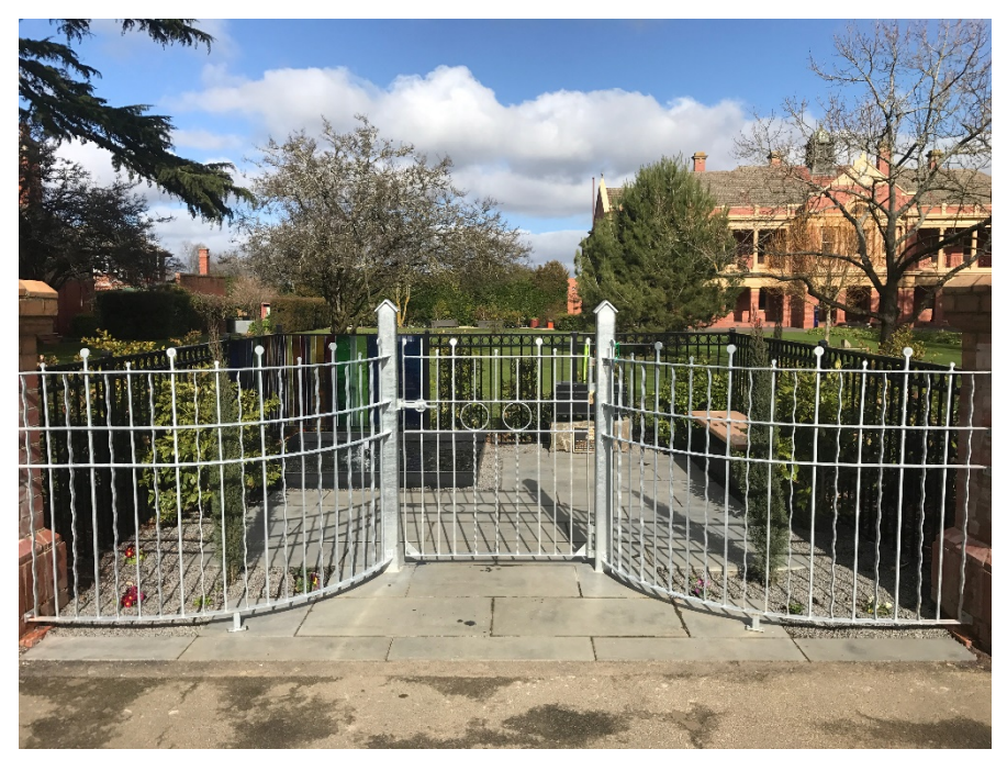
Figure 2.6 St Patrick's College reflective garden and monument, Ballarat (Sturt Street perimeter)