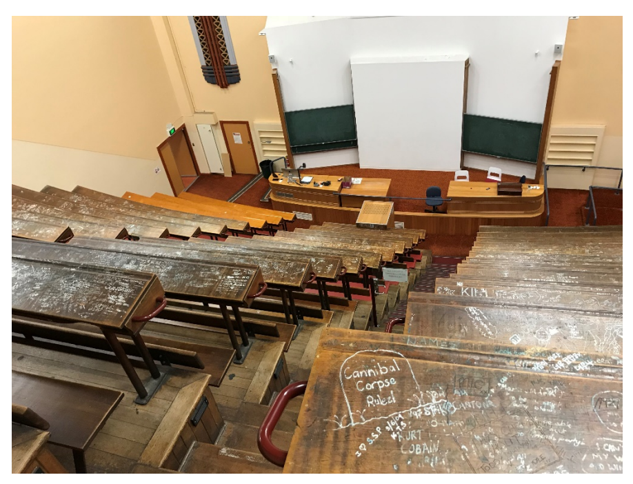
Figure 4.1 Masson Theatre, the University of Melbourne