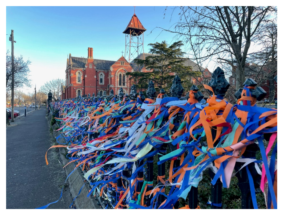
Figure 2.9 St Patrick's Cathedral, Ballarat (Dawson Street perimeter, daytime)